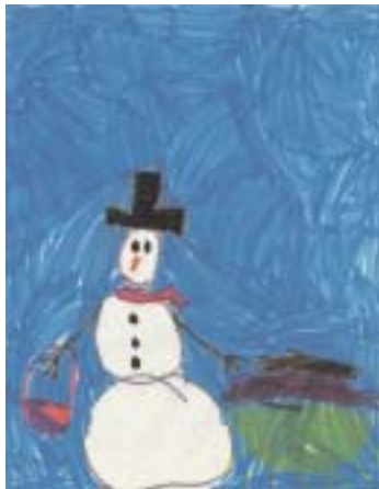
Megan Lutz, Age 7

It is very important to drink water following a massage or workout. It works to remove “free radicals” and other muscle waste products that are released during a massage or exercise session.