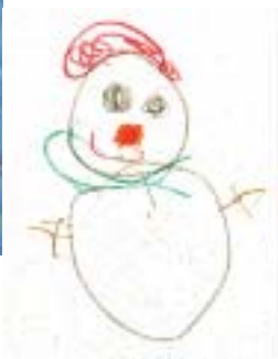
Matt Lutz, Age 4

Looks like big sister may have inspired brother?