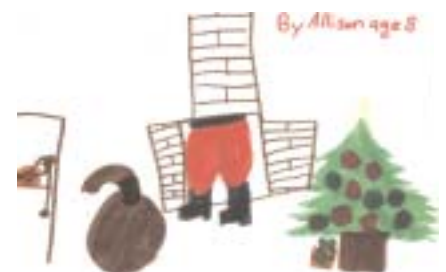
Allison Spoolman Age 8

Humm? Another case of big sister influencing younger brother!