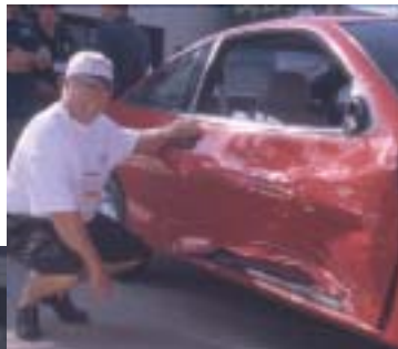
Nice hat, doctor!